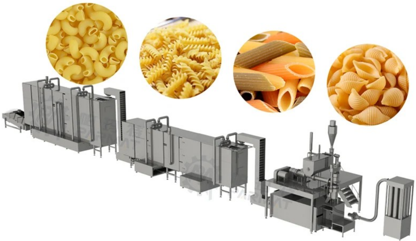
Pasta Production Line